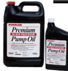
Vacuum Pump Oil QT. = RS 13203 GAL. = RS 13204