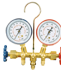
R-134A Manifold With 72" Hoses RS 40134A