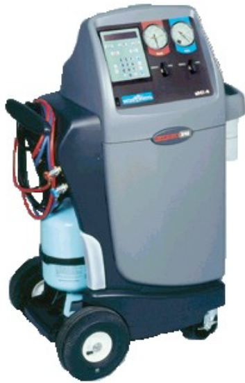
RS 34788 R-134A Recycling machine