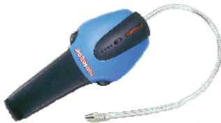
Leak Detector RS 16600