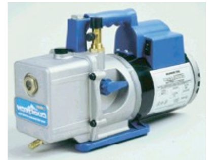
Vacumaster Pumps RS 15434 RS 15600